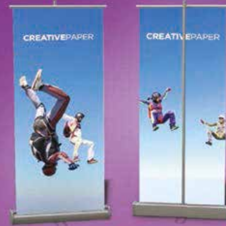
ROLLUP BANNER YUPO®FRJ