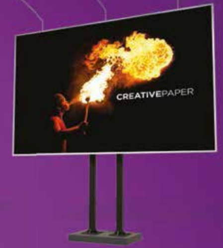
BACKLIT POSTERS YUPO®BLOCKOUT