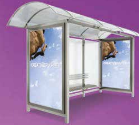
CITY LIGHT POSTER YUPO®BLU