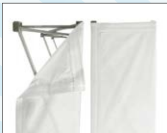
The image is attached with velcro.

Soft Image gives you a feature wall of several square metres that easily folds away in just a few seconds. The fabric image is stored and transported already mounted on the display and the low weight makes it easy to move.