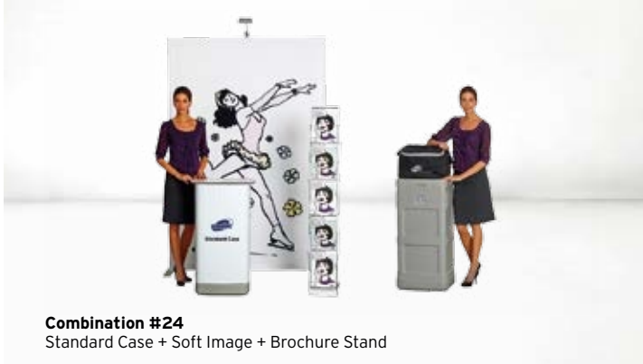
Combination #24 Standard Case + Soft Image + Brochure Stand