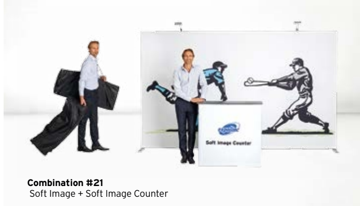
Combination #21 Soft Image + Soft Image Counter