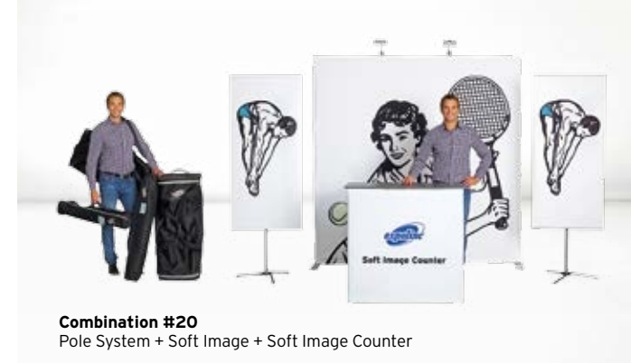
Combination #20 Pole System + Soft Image + Soft Image Counter