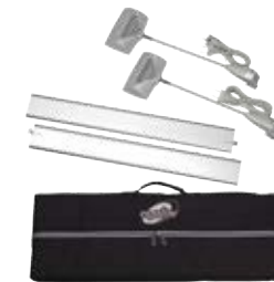
Spotlight kit with 2 halogen lamps, stabilising feet and protective nylon bag available as option.