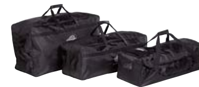
Nylon bags in different sizes available as option.