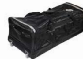
Multibag with wheels for easy transport.