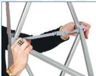
Easy to lock and unlock the system.