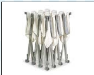
Image attached to system during transport.