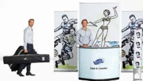
Combination #5 Roll Up Classic + Case & Counter + Brochure Stand