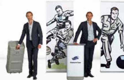
Combination #3 Roll Up Classic + Standard Case