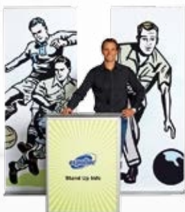
Combination #2 Roll Up Classic + Stand Up