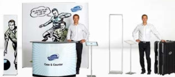
Combination #16 Flat Base & Magnet Frame + Pop Up Magnetic + Case & Counter + Info Stand