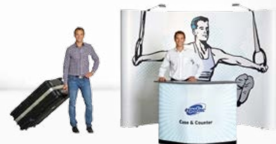
Combination #13 Pop Up Magnetic + Case & Counter