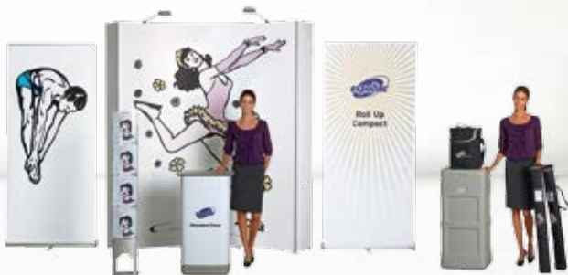
Combination #14 Pop Up Magnetic + Brochure Stand + Standard Case + Roll Up Compact